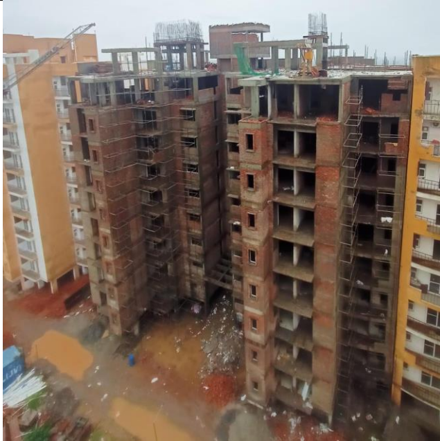
INTERNAL FINISHING IN PROGRESS