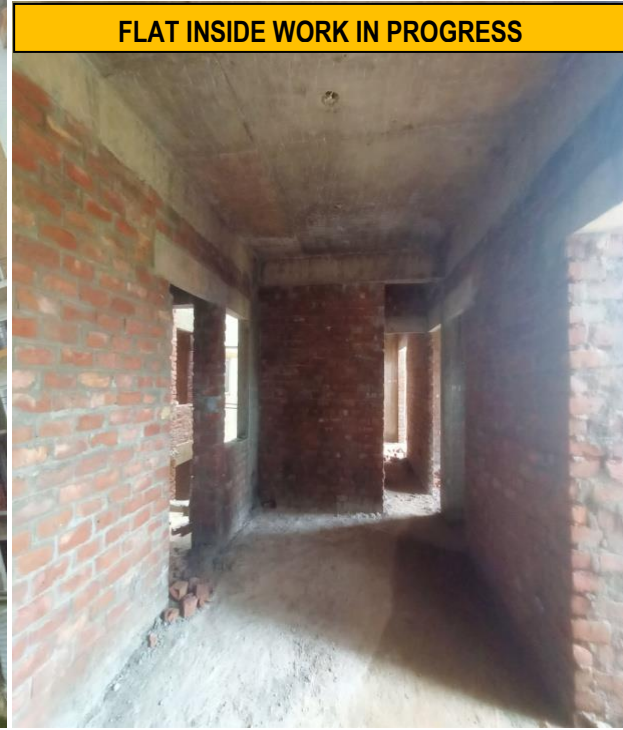
FLAT INSIDE WORK IN PROGRESS