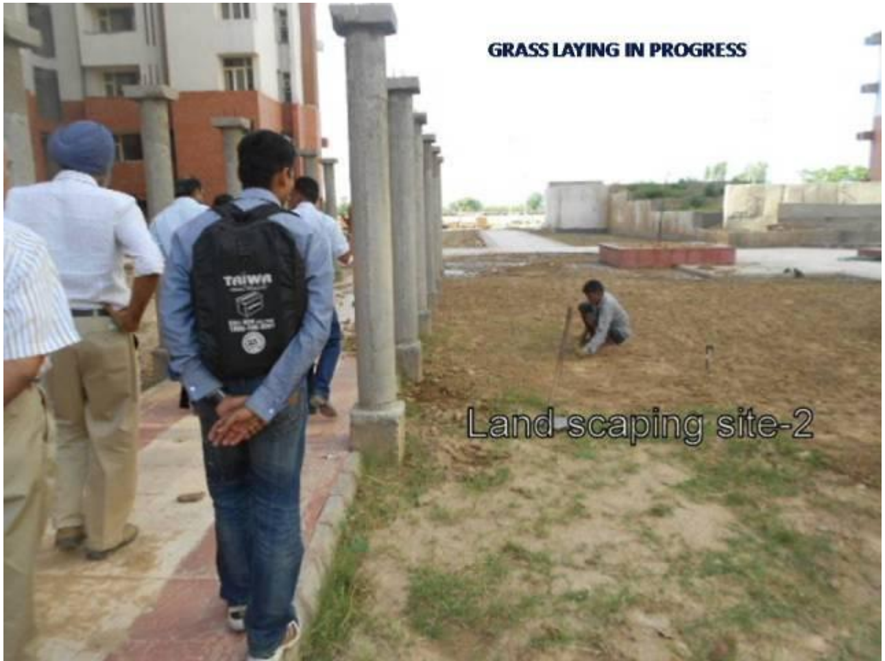
GRASS LAYING IN PROGRESS